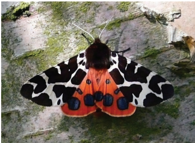
Garden tiger moth

Grid ref: NT 459 798. Families. Children must be 5+