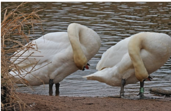
Mute swans on the river Tyne

Grid ref: NT 651788. Car park charging applies. Families. Children must be 5+.