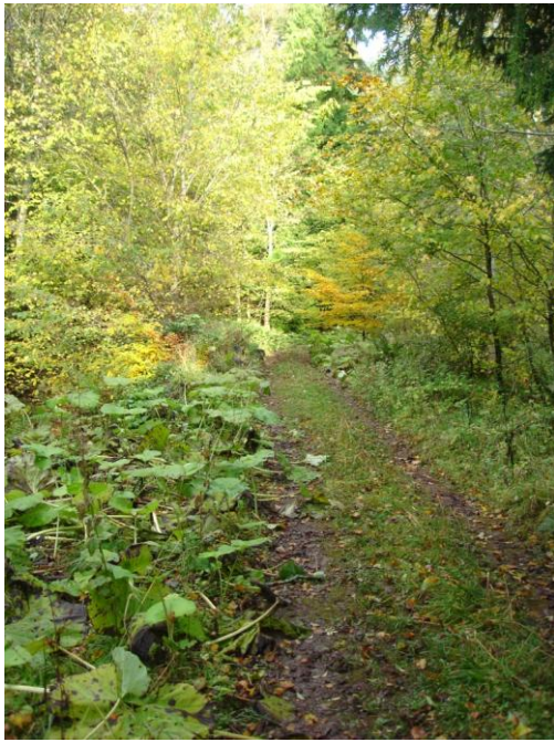
Track through Yester estate and its policy woodlands

(On the detour) Yester Castle: Built in the late 13 th century by Hugo de Gifford who employed French masons. It is said that the stone work was so fine and it was built so quickly that many locals believed it was the work of Goblins. This castle did not last long, being levelled in order to prevent use by the English, a policy instigated by King Robert the Bruce. However the original 13 th century vaulted underground chamber –the Goblin Ha’ (hall) is still intact. In the 14 th century the castle passed to the Hay family who, in 1557, moved to the more comfortable surroundings of a new home on the site of the present Yester House.