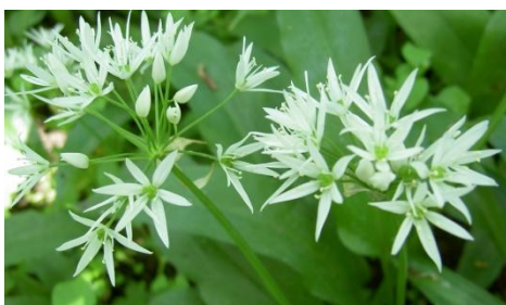
Wild garlic pervades the banks of the Gifford Water in spring

Gifford is a planned village, developed in association with textile and paper mills and had two annual fairs. One paper mill produced Bank of Scotland notes. The village is approached along a fine avenue of lime trees; to the left is a park originally the bleaching field and to the right an enclosure surrounded by stone walls - the pound. This was for holding cattle overnight prior to being driven to market. From 1901 to 1933 Gifford was the terminus of a railway line which linked the village, by a rather circuitous route, to Edinburgh, providing an easier way to transport cattle as well as people.