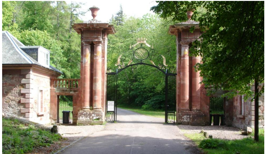
Looking back to the entrance gates of Yester Estate

Yester House was built in 1715. There is no public access to Yester House or its immediate grounds.