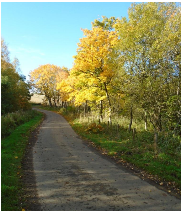
You cross a minor road between Donolly and Danskine.

Danskine: Former marshy ground in which Oliver Cromwell's cannons became bogged down, en route from Edinburgh to Dunbar. Local tradition has it that the troops drank all the beer found in the Garvald breweries. Danskine loch was dug by the 8 th Marquis of Tweeddale in the 1840's and is now used as a carp fishery.