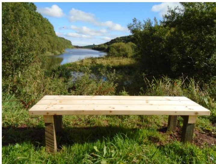
A welcome rest at the west end of Donolly reservoir