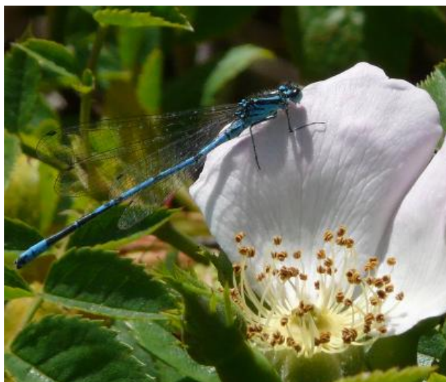
Common blue damselfly