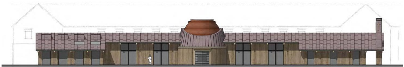
Proposed Reception area, Shop and Tearoom